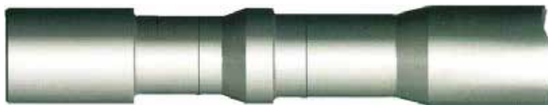
Elevator and Slip Recess Groove