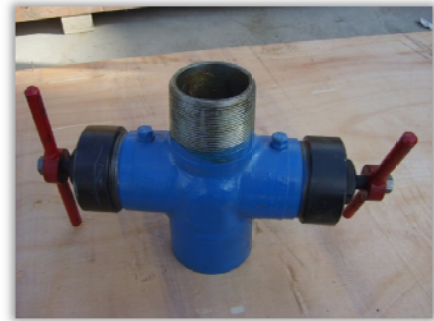
Polished Sucker Rod BOP

Main pressure of our sucker rod BOP is 1,500 or 2,000 psi.