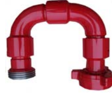
Long Radius Swivel Joint

Both long and short radius swivel joints are available. Long radius swivel joints can minimize fluid shock, and has better performance of resistance for scouring and erosion. Short radius swivel joints are mainly for low pressure operation due to limited installation space. Main styles of long radius swivel joint are style 10, style 20, style30, style 50, style 80, style 100 which can be used to replace FMC swivel Joint, SPM swivel joint, Anson swivel joint.