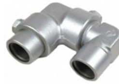
Short Radius Swivel Joint