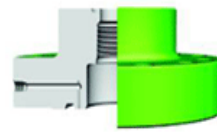
Tubing Head Adapter