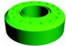
Double Studded Adapter