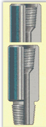
B. Cross-over sub box to pin