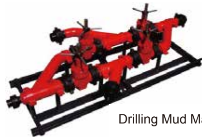
Drilling Mud Manifold

Drilling mud manifold consists of mud valve, high pressure spherical union, high pressure core union, tee, high pressure hose, elbow, pressure gauge, and pup joint etc. Jereh supplies various mud manifold from 2”~4”, with working pressure 2,000PSI~10,000PSI as per API SPEC 16C /6A.